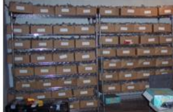
out of 4500 pairs