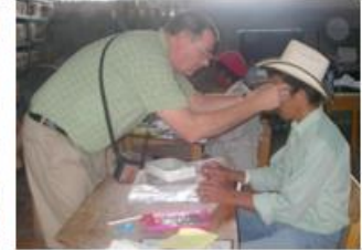
Fit the glasses