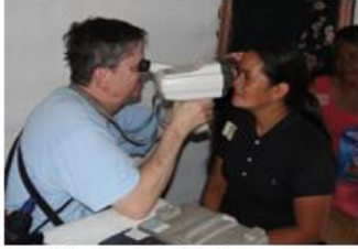
Measure their eyes

A free Glasses clinic will be provided from 9AM until 3PM on December 8, 2023 at Fern Creek Baptist Church. The sole service provided will be fitting the patients eyes with glasses out of an inventory of nearly 4500 pairs in an effort to improve their vision. An optical professional will be available.