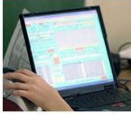
Find the right pair